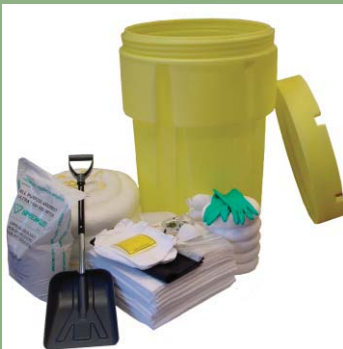
(option: mobile 95gallon overpack)