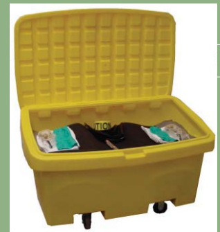
(optional casters available)